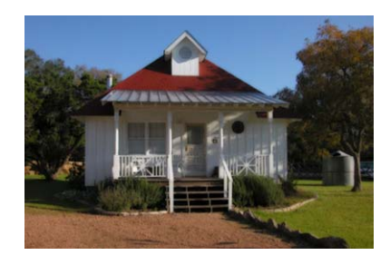
Representative Architecture & Cypress Creek