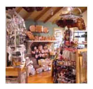
Wimberley Town Square Shops & Restaurants Are Just A Quick Walk Down the Lane